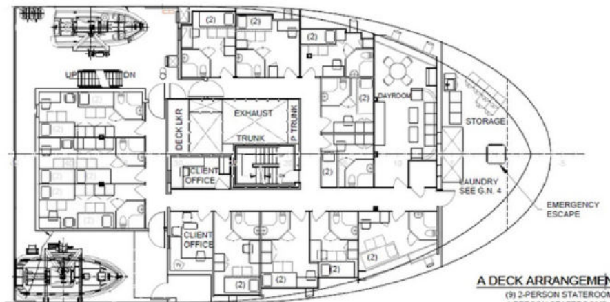
A DECK ARRANGEMENT (9) 2-PERSON STATEROOMS (3) 4-PERSON STATEROOMS 30 TOTAL